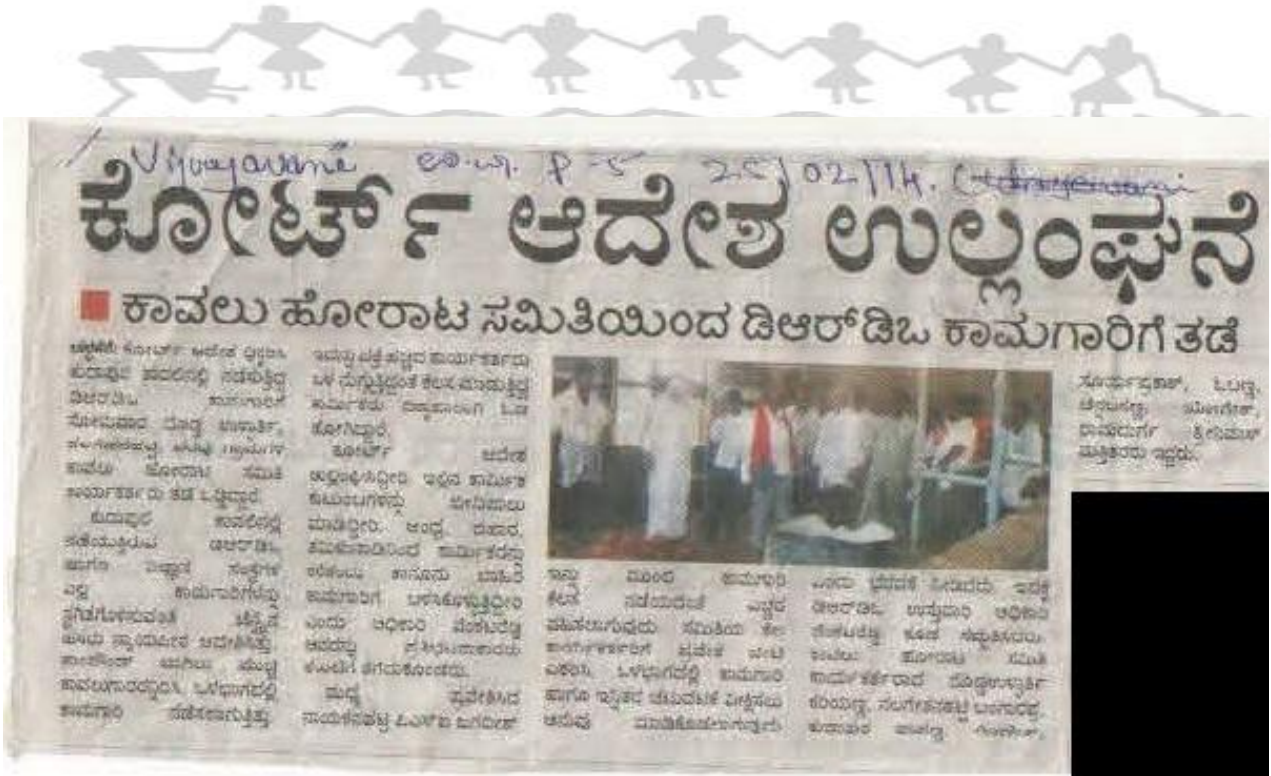
Press Clipping from Vijayavani paper, Bangalore dated 25/2/2014