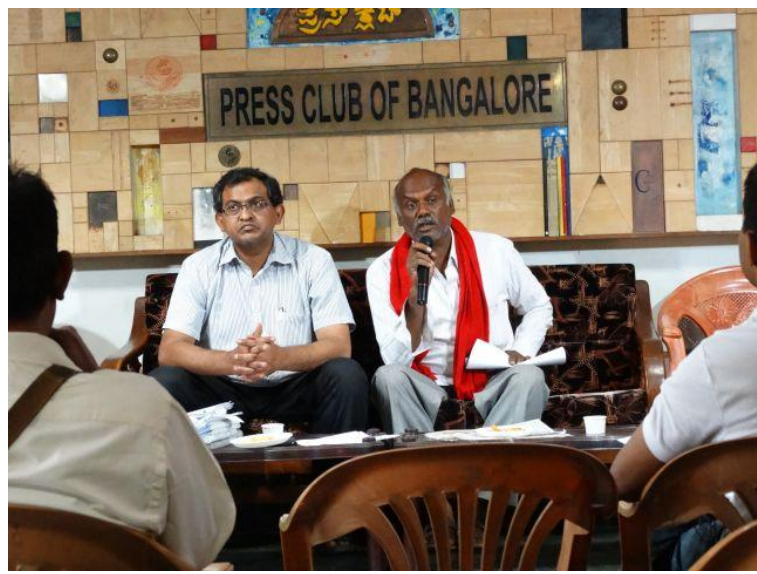
Press Conference in progress at Press Club, Bangalore on 26.2.2014